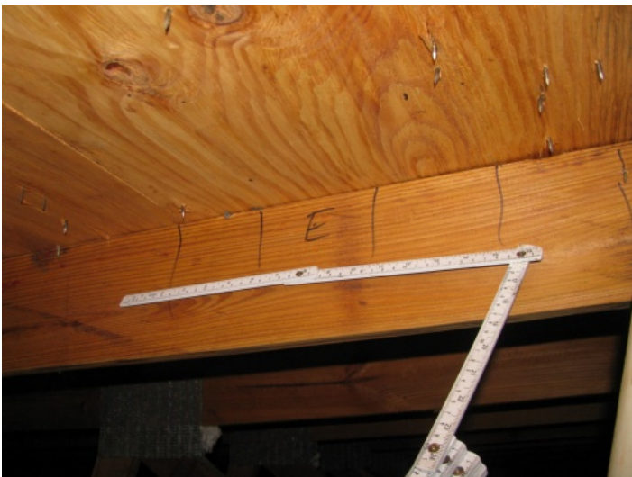
Roof Deck Attachment - 6" spacing on the edge