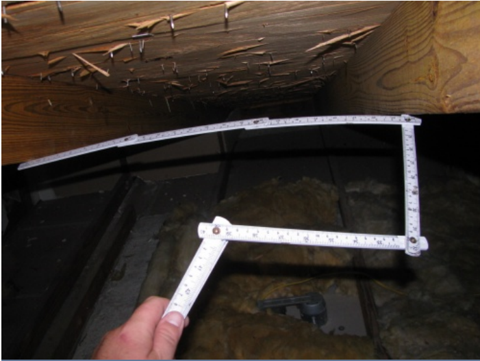
Roof Truss Spacing - 24"