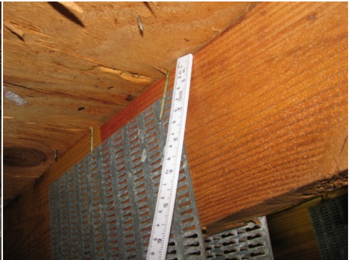
Roof Deck Attachment - 8d nails