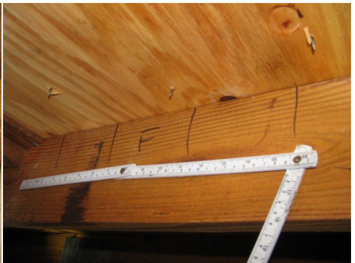
Roof Deck Attachment - 6" spacing in the field