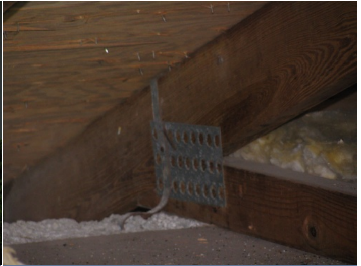
Roof to Wall Connection - single wrap straps front side with 1 nail