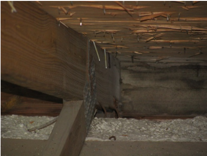
Roof to Wall Connection - single wrap straps back side with 1 nail