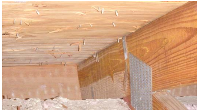
Toe nails - straps with only two nails